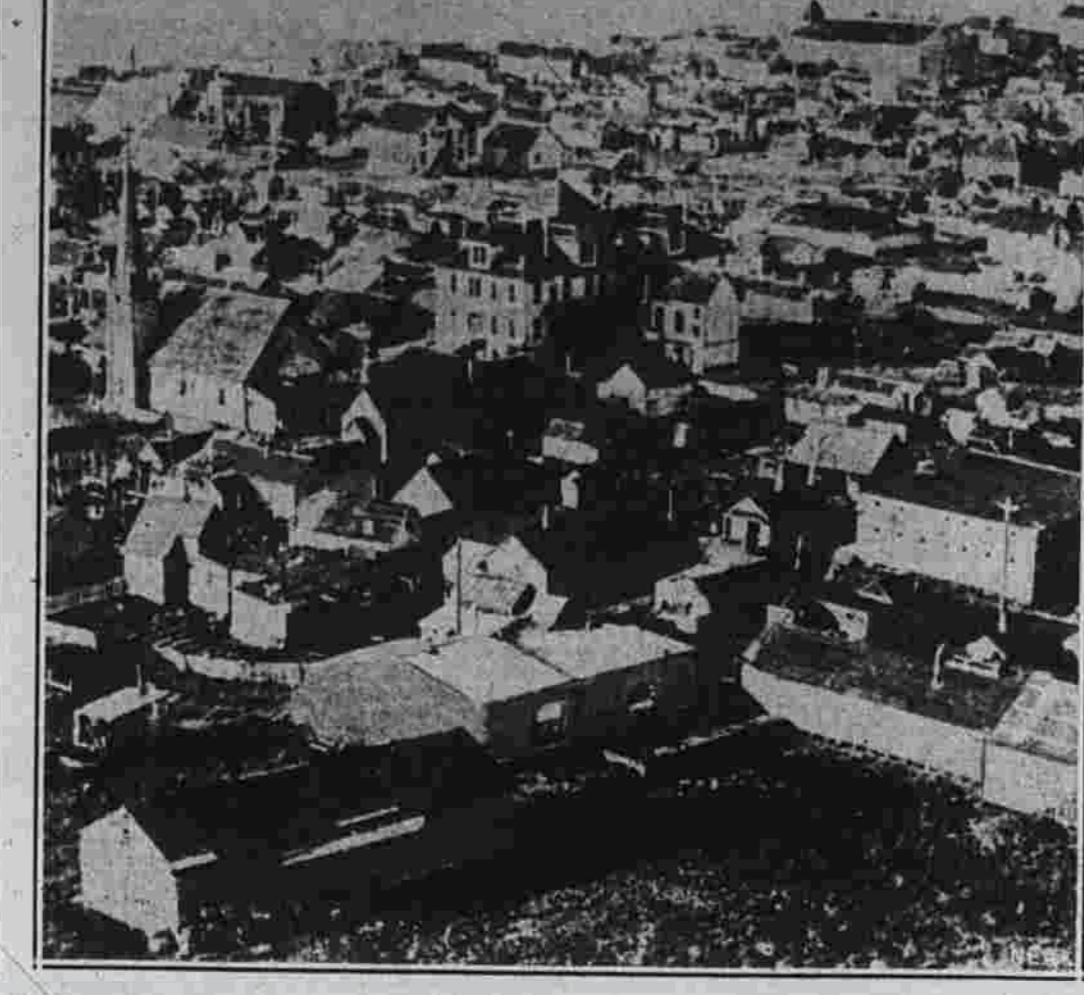
Almost every building in the world's most famous gold rush town, Nome, Alaska, was reduced to ashes as a wind-fanned fire swept from block to block after starting at the Golden Gate Hotel, rendering 1,500 people homeless. The highly inflammable nature of the buildings, most of them of wooden frame construction, is clear from the above picture. The absence of trees is due to the bitter Arctic cold that grips the community most of the year.